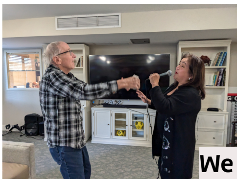
We love dancing at Happy Hour!