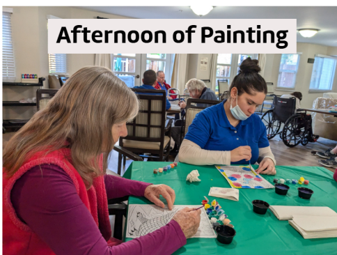
Afternoon of Painting