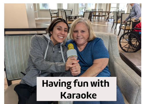
Having fun with Karaoke