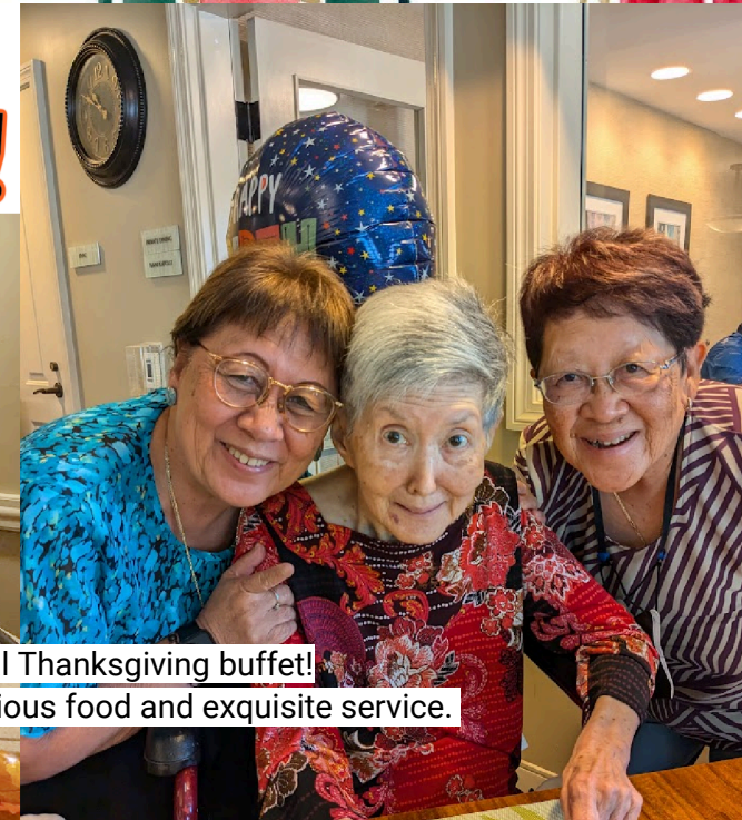
We hope everyone enjoyed our annual Thanksgiving buffet! A huge Mahalo to our Dining Team for the delicious food and exquisite service.