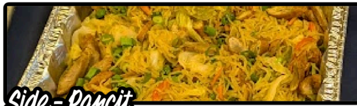
Side - Pancit