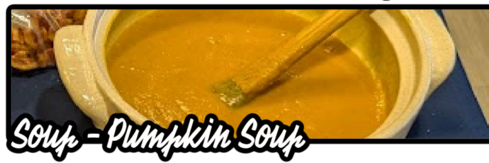
Soup - Pumpkin Soup